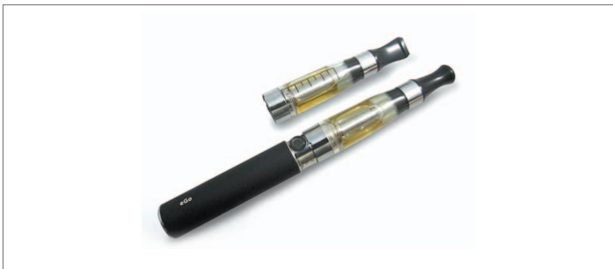
Figure 2: Example of a 'second generation' electronic cigarette

The second generation electronic cigarette look less like a regular cigarette and usually contain a 'tank' that the user fills with their choice of electronic cigarette liquid; in which they can decide upon flavours and strength (nicotine concentration typically ranging from 0 to 24mg/ml). There appears to be a trend towards more experienced electronic cigarette users ('vapers') preferring newer generation electronic cigarettes (often called personal vapourisers). These bear little resemblance to cigarettes and can be used with a range of atomisers, cartomisers, and tank systems giving the user a greater range of choice. These systems typically use larger batteries with adjustable power settings and replaceable coils and wicks.