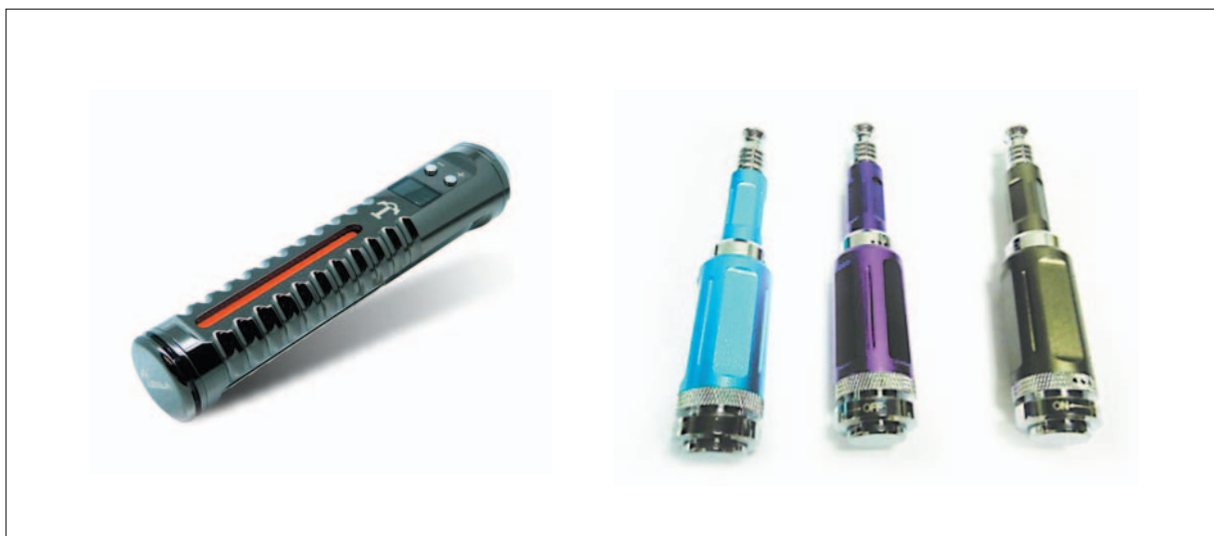
Figure 3: Examples of 'third generation' electronic cigarette

Electronic cigarettes have been developed as a 'lifestyle' or consumer product, and not as a medicine. Regulatory authorities in some countries have ruled that, as they contain nicotine, electronic cigarettes automatically fall under medicines regulation. e.g.2 The UK Medicine and Healthcare Products Regulatory Agency (MHRA) ruled in June 2013 that electronic cigarette manufacturers would need to obtain a license to sell electronic cigarettes by 2017.