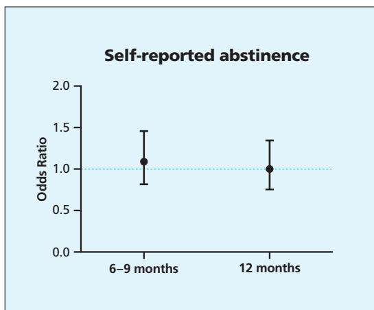
Figure 2. Effect of partner support interventions on self-reported abstinence at different time points.

Pooled odds ratios (95% confidence intervals) for abstinence in randomised controlled trials comparing interventions with and without partner support. Data from Park et al. 52